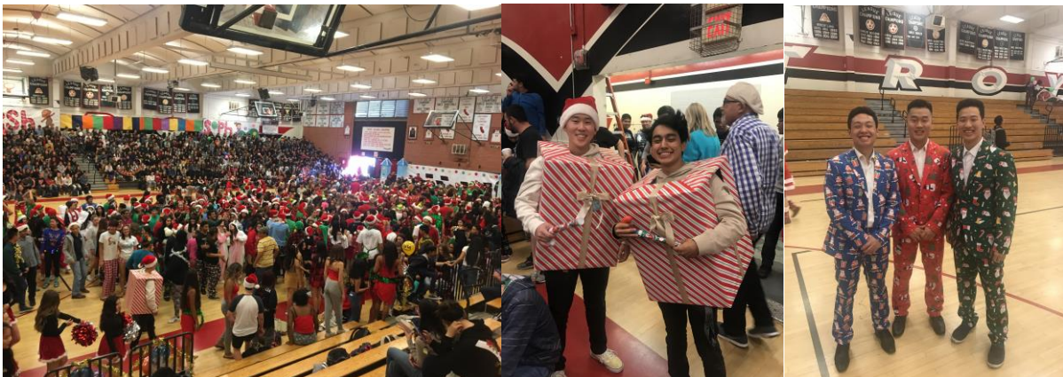
Some pictures of the students getting ready for the Elf Dance and examples senior costumes.

Last Friday we held the always memorable senior Elf Dance! This annual celebration of the holiday season was a good time for both the Elf Dance participants and spectators. Additionally, ASB did a wonderful job with keeping the rally moving and showcasing a number of different student groups ranging from NJROTC drill, Cheer, Band, and Color Guard. It was a memorable rally and one of my favorite at Troy so far! Great job Warriors!