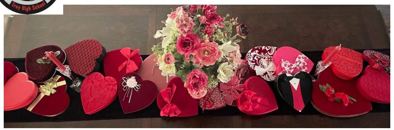
February 17, 2023

It is the end of Valentine's Day/Week which actually began last Friday, but it is likely restaurants, will still be busy through this long Presidents Day weekend for those wanting to miss the Valentine's Day rush. This will be our second three-day weekend in a row, and then we have a stretch until we get to Spring Break the week of March 19<sup>th</sup>. It has been a busy four school day week at Troy, and there is a lot to cover in this Warrior Weekly ! Go, Warriors!