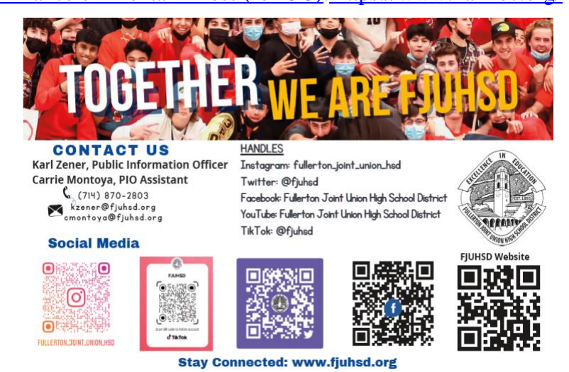
Warriors, here is the link to the Superintendent's newsletter for February! For the global FJUHSD insight, news, and events, it does not get much better! <a href="https://conta.cc/40vlJmM">https://conta.cc/40vlJmM</a>