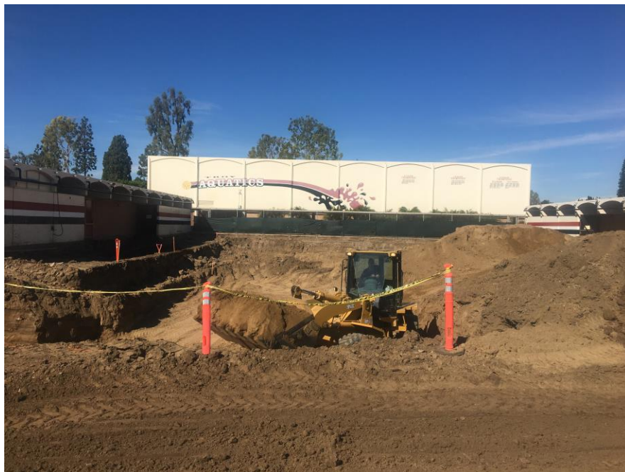
February, 2017 Troy's new pool construction continues!

http://www.ocreger.com/articles/science-743994-school-year.html