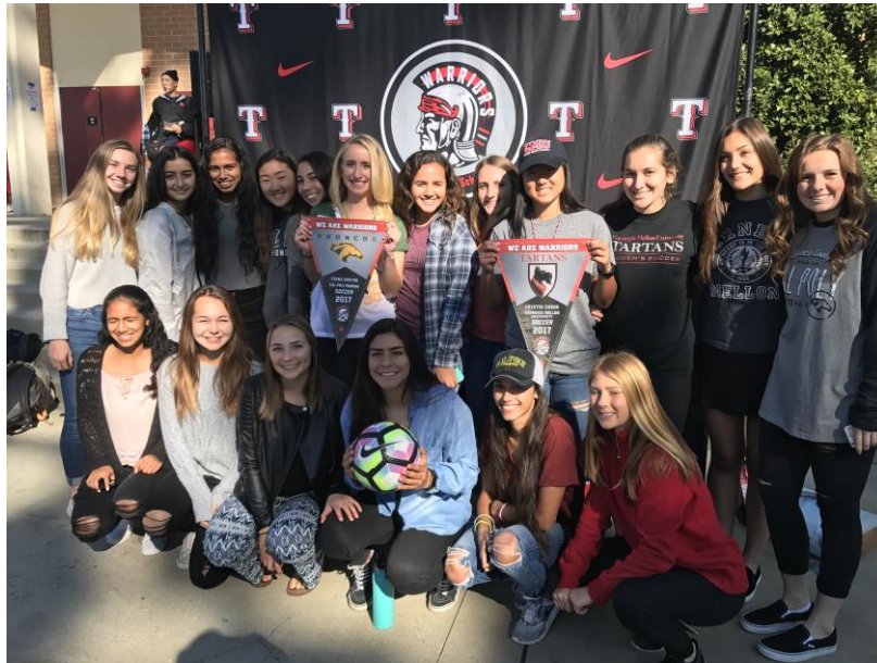
National Signing Day Troy & Future College Scholar/Athletes!

For many of our students, athletics in college will also pay part or all of their tuition which will ultimately make them and their parents very happy!