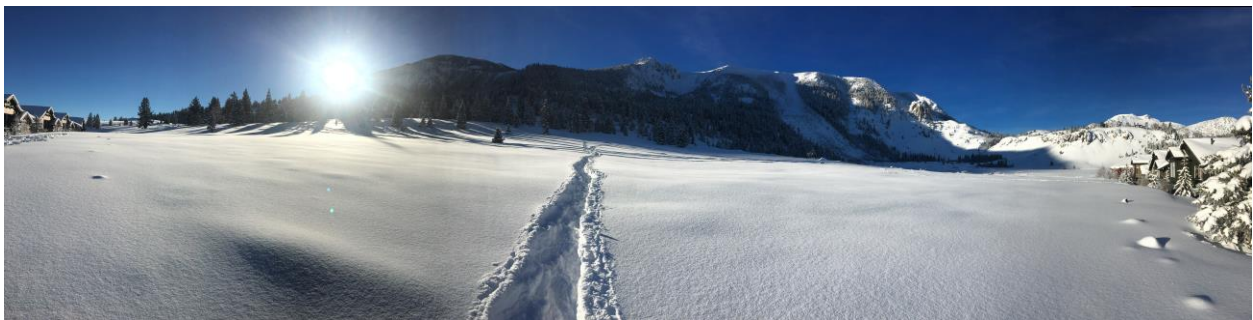
Mammoth Lakes, January 14, 2017.

It looks like we are going to have a rainy weekend, so if going to the snow is not in your plans, staying inside is probably a good idea. I think it will be a great weekend to drink some hot chocolate, and watch Star Wars, Episodes 2 & 3. Have a great weekend, and don't forget Monday, January 23 rd is a Late Start!