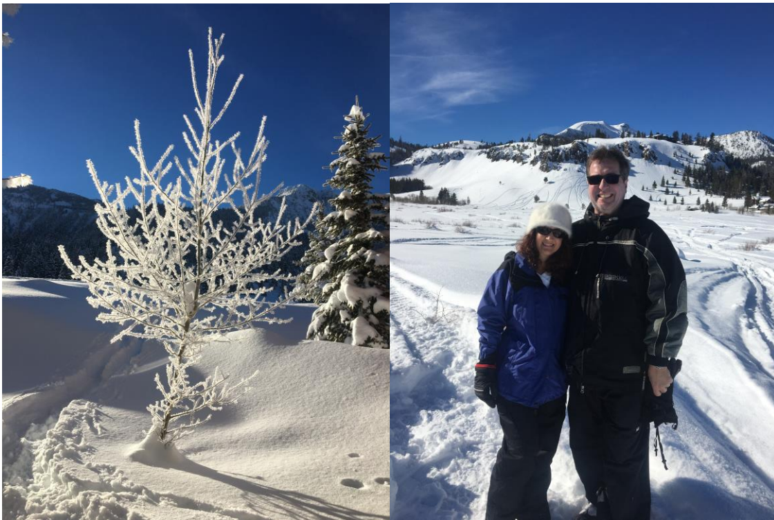
Mammoth Lakes, January 14, 2017.

In the past I have often praised the wonderful Southern California weather and the predictability of sunshine when the rest of the country is buried in snow and other types of inclement weather. It is now our turn, and we are getting the rain we desperately need, albeit it would be nice if the timing of the rain does not end our drought all at one time... Of course, it is nice to take advantage of snow when possible. ☺ For our commuters, slow down, and be as cautious and drive as safely as you are able!