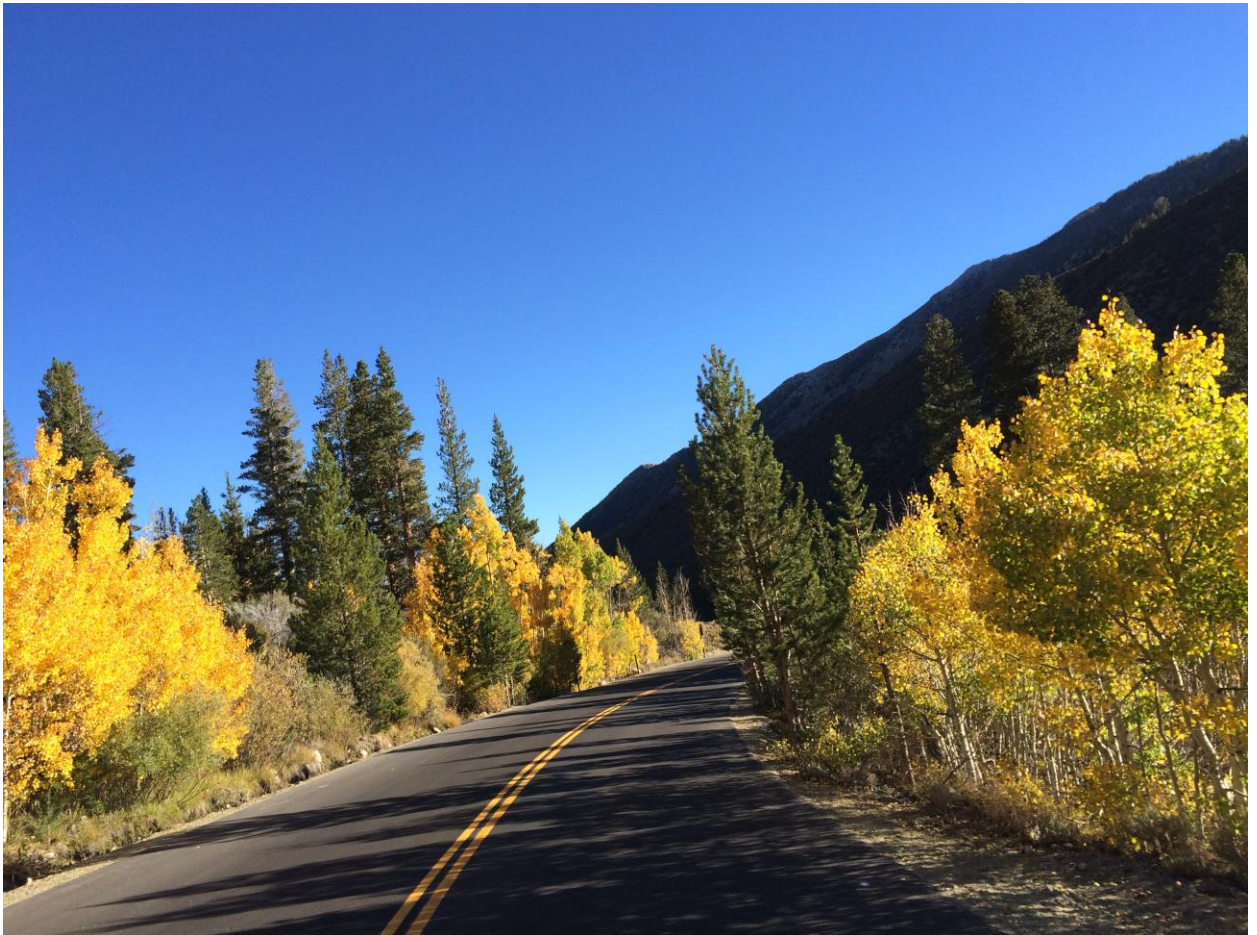
Red Rock Creek Road in Mammoth Lakes, CA.