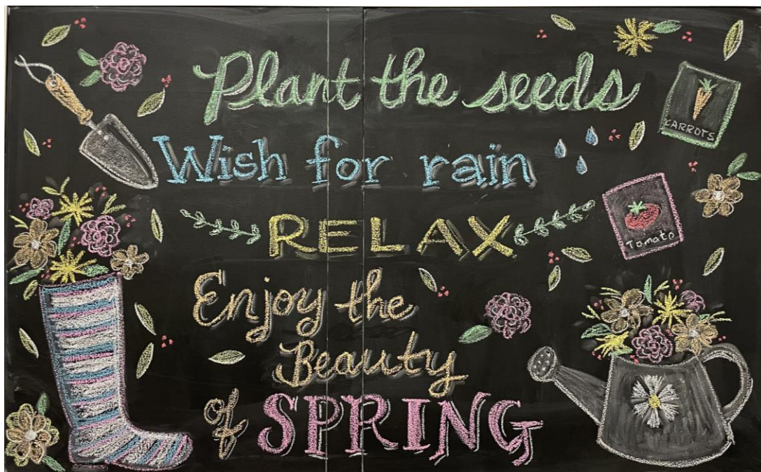
Artist: Ms. Shannon Cogswell

https://mail.google.com/mail/u/0?ui=2&ik=8bccad7511&attid=0.1&permmsgid=msg-f:1718061514680932986&th=17d7c7d84cd39a7a&view=att&disp=inline&realattid=f_kwp79z6i0