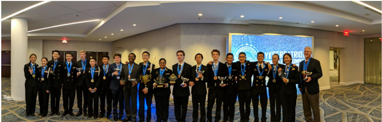
All three 2018, Troy CyberPatriot teams at Nationals in Baltimore, Maryland.