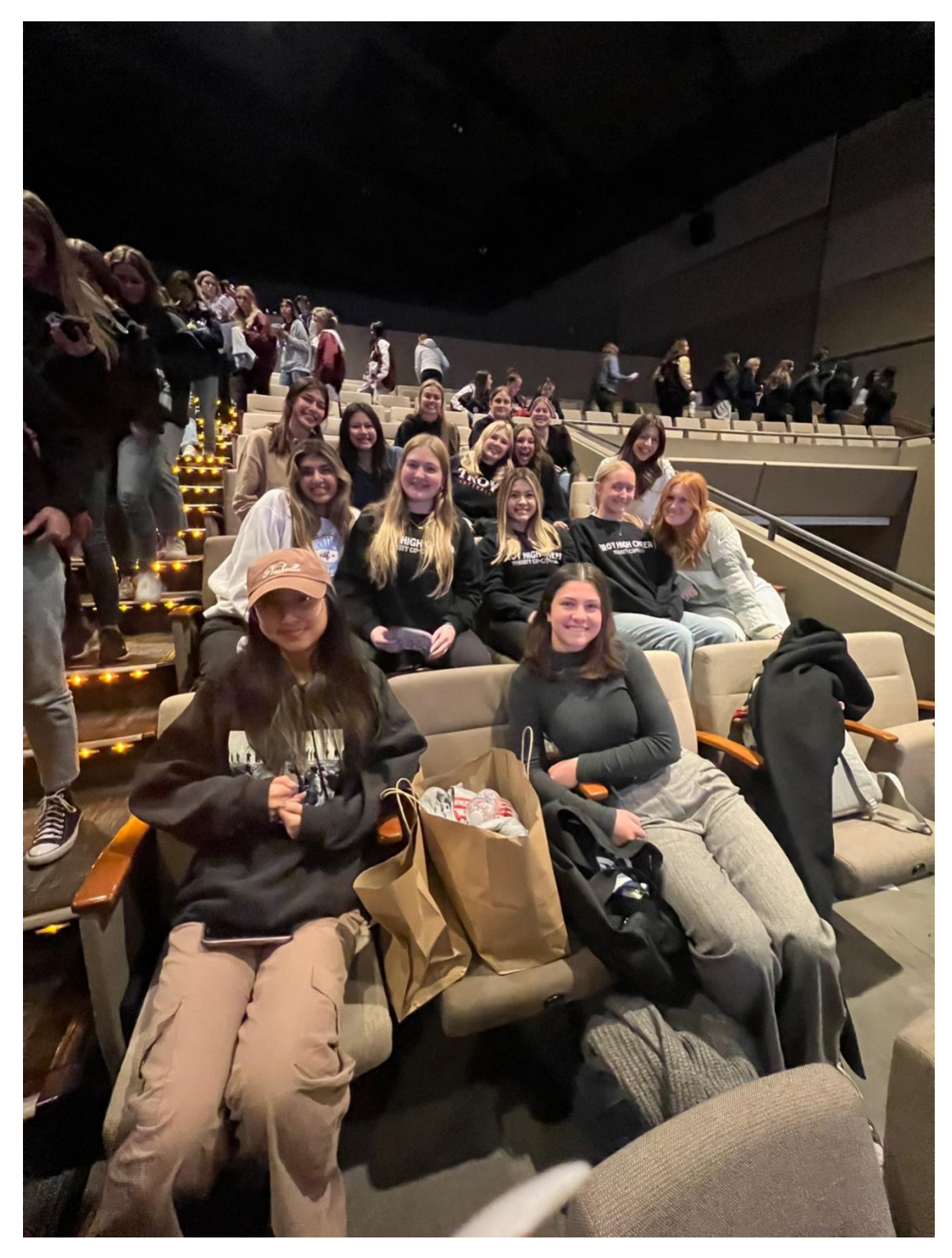
On Tuesday, fifteen young ladies from Troy attended the CIF Women in Sports Conference. This event supports, motivates, and provides a needed platform for speakers to encourage leadership development in our female athletes, encouraging the limitless possibilities of what women can accomplish in all aspects of life when given the same opportunities as men!