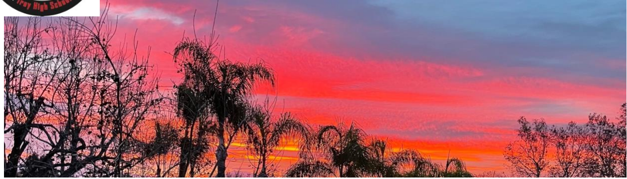
March 3, 2023

We are in March and continuing a storyline from the last Warrior Weekly , nothing says springtime like rain and even snow! I have pictures, and despite what I said about no anticipated snow at Troy, it turns out I was wrong. © It has been an interesting week with a lot of great things happening for our students! On to the news!