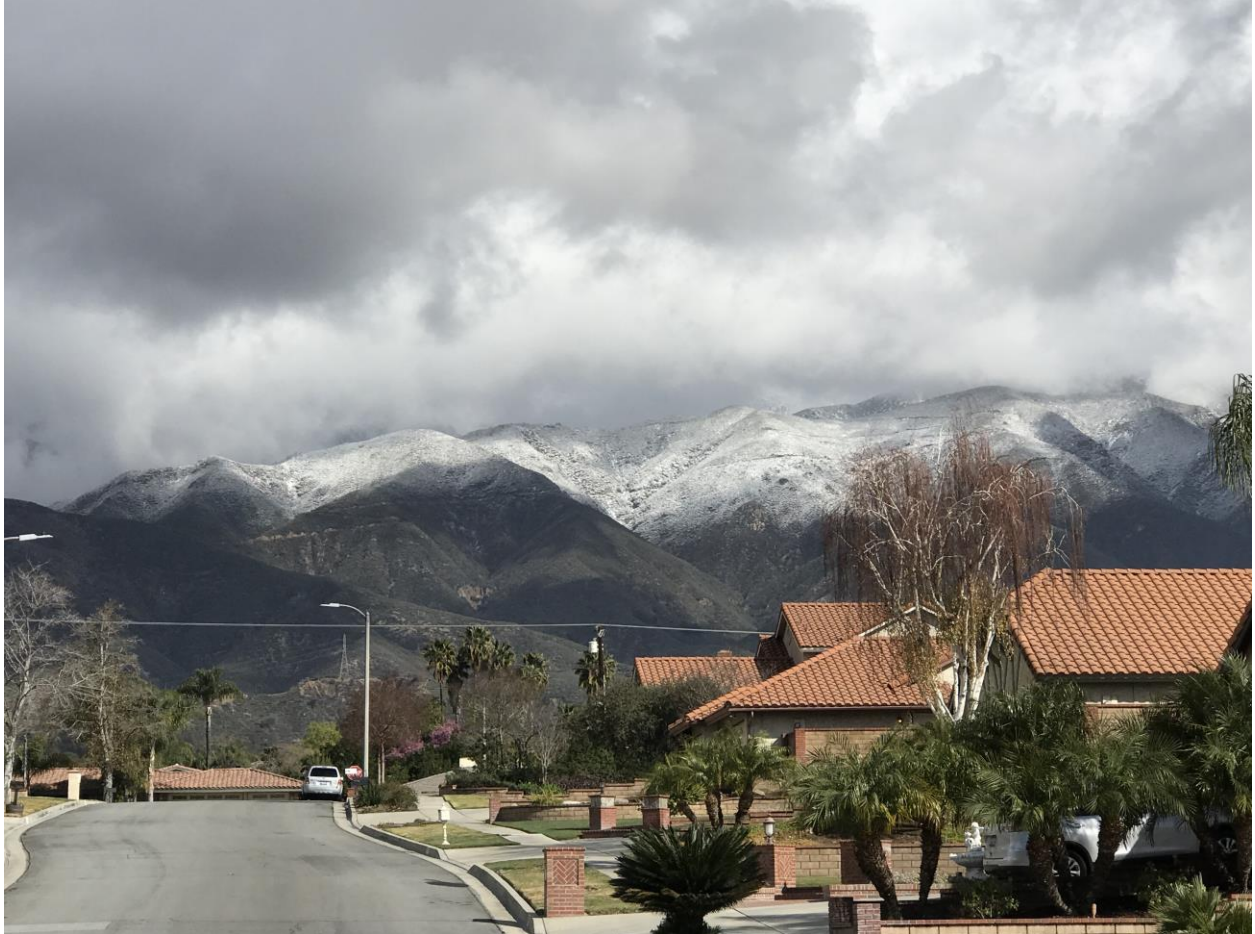
A view of snow in the foothills below Mt. Baldy from earlier this week.

I wish everyone a nice relaxing weekend! If you are a student or volunteer either attending or working our Sadie's Dance on Saturday night, I look forward to seeing you there! Keep in mind that it is going to be cold so even though the dance is in the gym, dress accordingly! Have a great weekend, and don't forget we have a Late-Start on Monday! I will see everyone Monday morning!