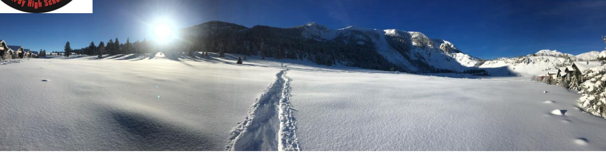
March 15, 2019

It is the Friday before the last week of school before Spring Break. 3<sup>rd</sup> Quarter grades are currently being updated by our teachers and they will be available for students and parents on Thursday, March 24! This semester is really moving, month after next is May which means graduation for the Class of 2019. Wow! Go Warriors!