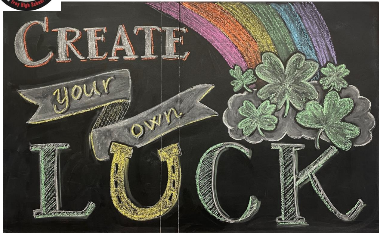
March 8, 2024