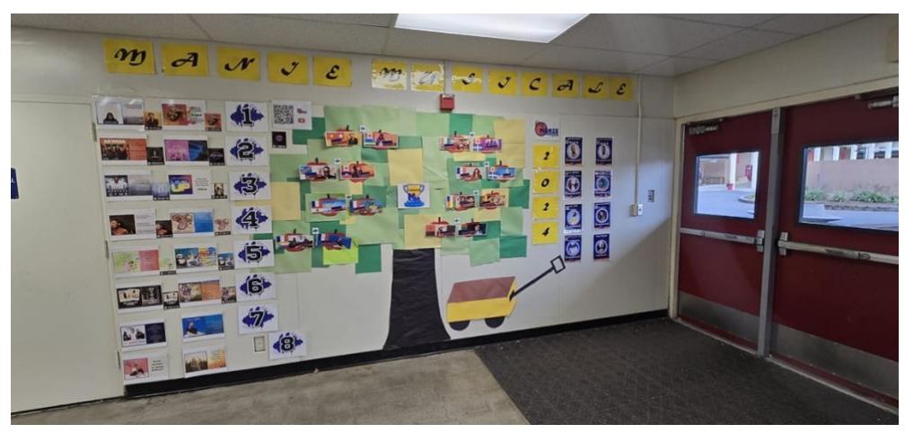
In the 400 hallway near Mr. Fritz's room you see this chart on the wall. Nobody can explain

Warriors, it a wonderful Friday to cap off a very busy week! Today we held our Prom Rally, which revealed our Prom location and announce the beginning of ticket sales. Students, you want to attend this Prom. The location is amazing and will be unforgettable!