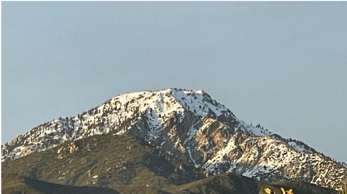
Mt. Baldy, CA February 25, 2024.