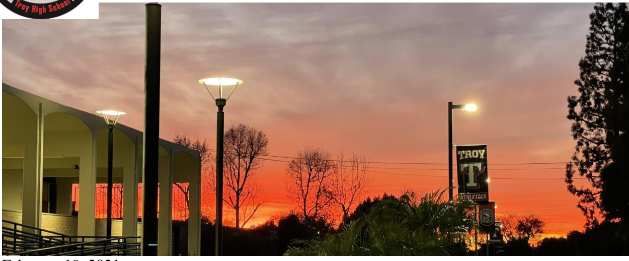
February 19, 2021