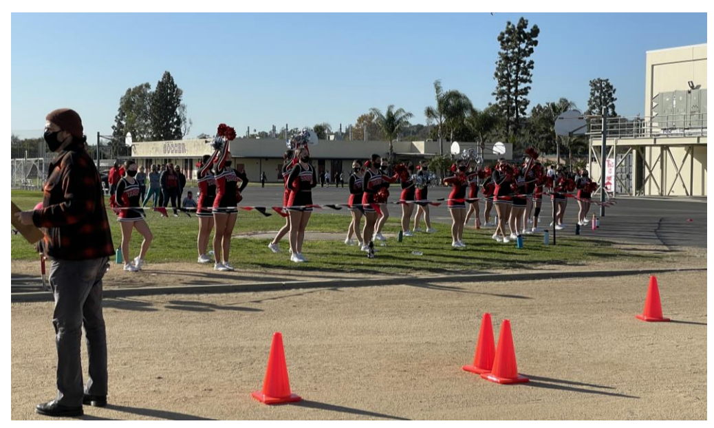
Troy's Cheer Team came out in support of our X-Country runners Wednesday which

We are just wrapping up a fantastic week, made better by the fact the COVID-19 numbers continue to fall, counties throughout the State continue to move closer to less restrictive tiers (including our own), and we have Teachers and Students back on campus! With all we have been through the past year, what could be much better? Ok, I know everyone has a list... \odot We have a fair amount news, so let's get going!