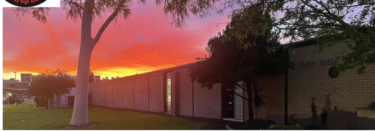
February 11, 2022