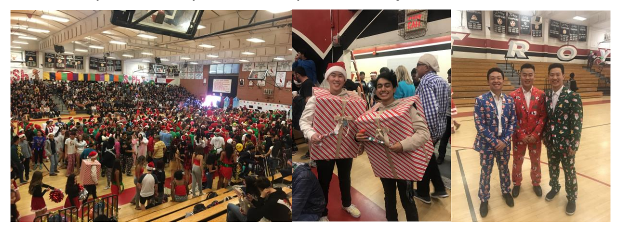
Some pictures of the students getting ready for the Elf Dance and examples senior costumes.

Last Friday we held the always memorable senior Elf Dance! This annual celebration of the holiday season was a good time for both the Elf Dance participants and spectators. Additionally, ASB did a wonderful job with keeping the rally moving and showcasing a number of different student groups ranging from NJROTC drill, Cheer, Band, and Color Guard. It was a memorable rally and one of my favorite at Troy so far! Great job Warriors!