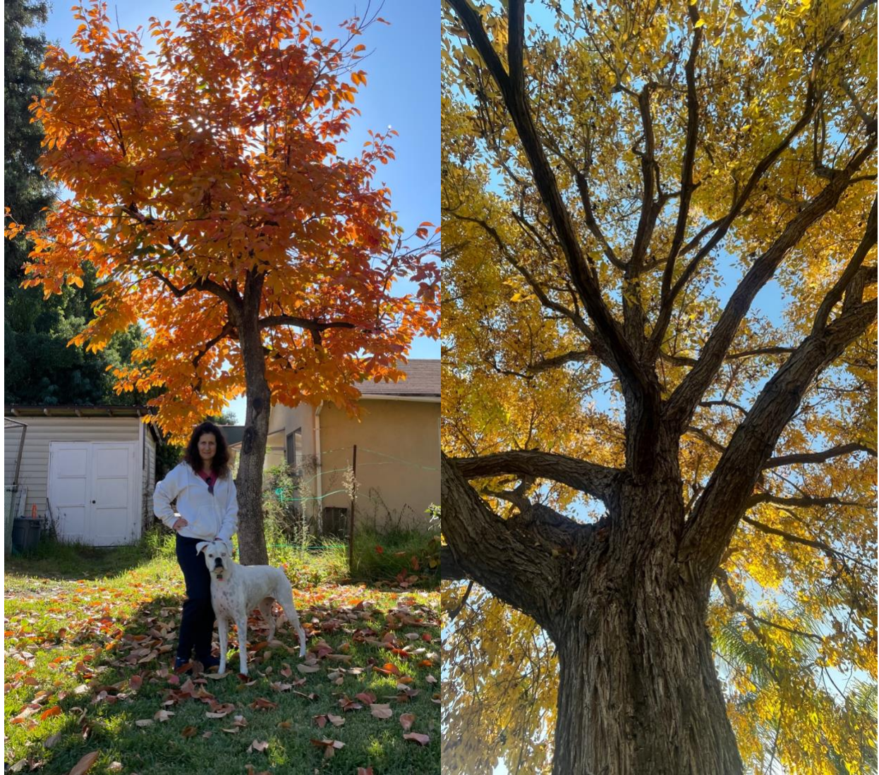
The Persimmon tree in my Mom's backyard last week. The I don't know what kind of tree in my backyard 12-9-23.

The Fall Season along with our Fall Semester is winding down, and the colors of the leaves while still vibrant are making their way to the ground. Enjoy the next couple of days because it looks like the fall colors are about to end. The rain begins late Sunday and may rain throughout much of next week...perhaps good for snow at our local ski areas?