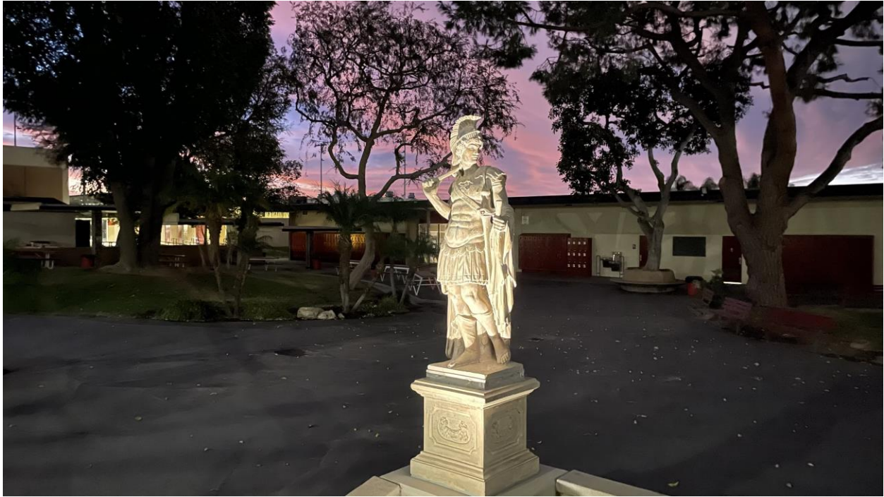
Early morning @ Troy, 12-9-20

Suffice to say, the yellow tree has significantly less leaves than in these pictures...Enjoy the cooler weather, as it makes it easier to stay inside, sip hot coco, and study for Finals. ☺