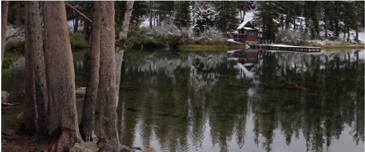
Light dusting of snow at Lake George in Mammoth Lakes a couple of years ago.