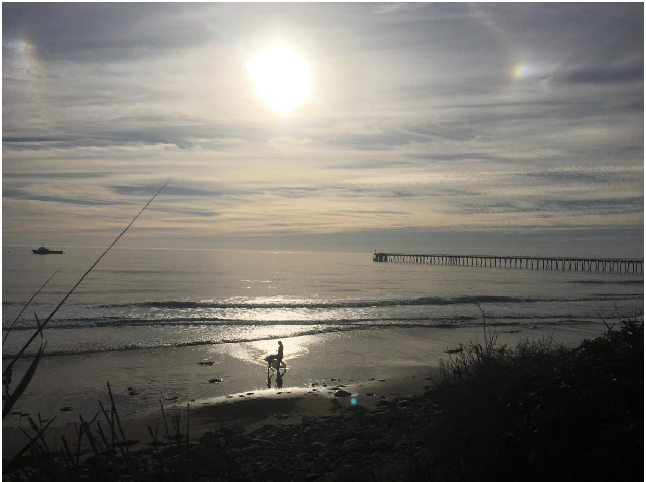
November 12, 2016 Santa Barbara coastline.