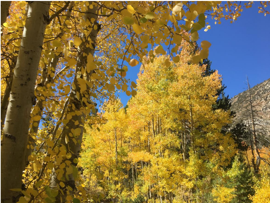
Bishop Creek, 2016