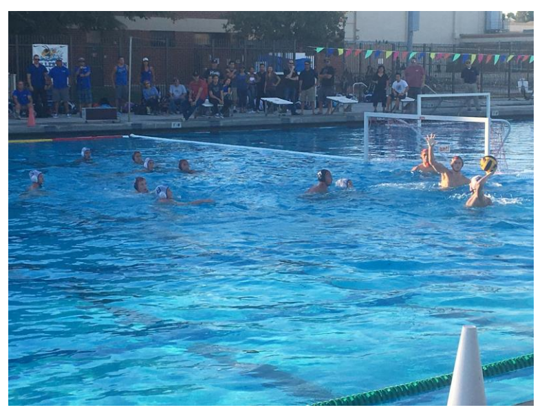
November 9, 2016

Yesterday our Boy's Water Polo team won their first round CIF match against Temescal Canyon High School 16-8! Our team overcame our opponent scoring first and quickly took control of the match. It was amazing to see the level of play, skill, and fitness that is required to play water polo at this level! Congratulations on a fantastic win in the first round and good luck to our Warriors for our Saturday match away against Redlands!