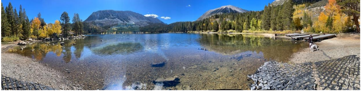
Rock Creek Lake near Mammoth Lakes, CA on October 8, 2023.