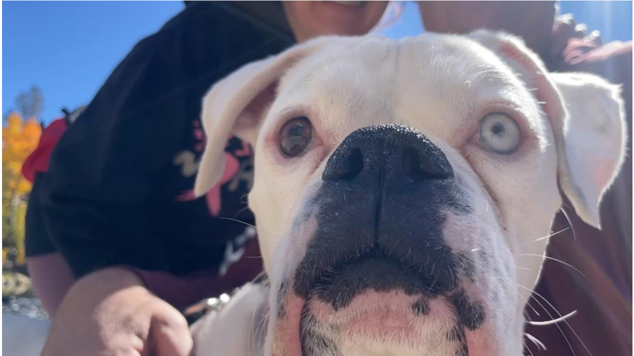
Mammoth Lakes, October 2023.

Have a wonderful Friday and weekend! If you are not an outdoors person this is the weekend to try again. It does not get any better than this, so enjoy these warm Fall temps before we get significantly cooler weather and the possibility of some light rain early next week. Hiking, biking, running at the beach or in the mountains, all of it is going to be good this weekend. A great way to begin the weekend is at the football game in La Habra tonight! I hope everyone will have a wonderful weekend and have time to spend with friends and family. I will see everyone back here on Monday morning!