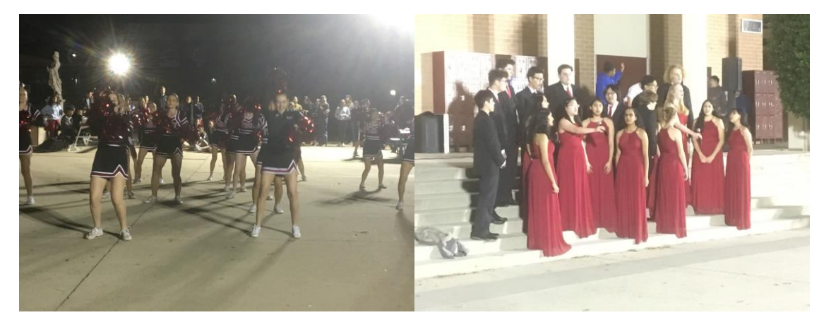
Open House 2019 is in the books! Thank you to all our entire Troy family for a great night!

Tomorrow, Saturday, January 26<sup>th</sup> is the last testing date of the annual Troy Tech / Honors Testing process for incoming 8<sup>th</sup> graders. For 8<sup>th</sup> grade students outside the FJUHSD school boundaries, this is the only way to have the opportunity to attend Troy High School by qualifying for the Troy Tech Magnet Program. Students are tested in English, Composition, and Mathematics at their 8<sup>th</sup> grade mid-year level point. The Check-in for testing begins at 7:15am in the North Gym and students need to have a parent, photo ID or passport, and printout of their current 8<sup>th</sup> grade schedule, listing their current math course. After the students have checked-in, parents are excused until testing is over, which is usually right around noon. For the 8<sup>th</sup> graders to be fully prepared for the test, all parents should make sure their child had a good night's sleep and a hearty breakfast. They should come into the test relaxed and ready!