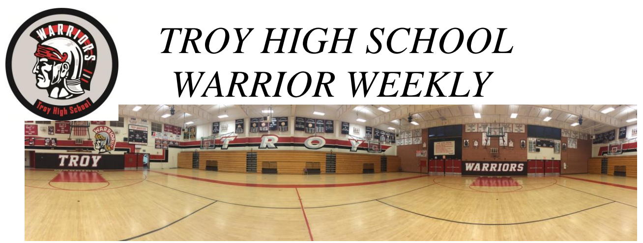
February 24, 2017

It has been a great week at Troy High School! We have held and are having today, athletic, music, and the arts events. We had a fantastic Choir Concert on Wednesday and have a Instrumental Performance tonight! In our classrooms, our students and teachers are moving at speed, and on our site we have new and ongoing construction that continues to improve our school and how we will be able to serve our students and community! It is great to be a Warrior!