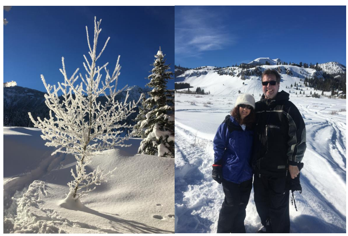
Mammoth Lakes, January 14, 2017.

In the past I have often praised the wonderful Southern California weather and the predictability of sunshine when the rest of the country is buried in snow and other types of inclement weather. It is now our turn, and we are getting the rain we desperately need, albeit it would be nice if the timing of the rain does not end our drought all at one time... Of course, it is nice to take advantage of snow when possible. © For our commuters, slow down, and be as cautious and drive as safely as you are able!