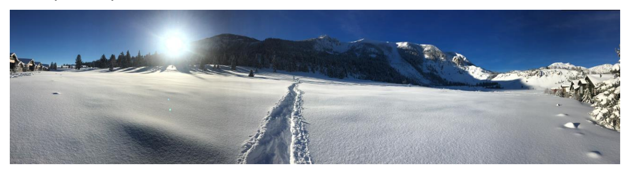
Mammoth Lakes, January 14, 2017.

It looks like we are going to have a rainy weekend, so if going to the snow is not in your plans, staying inside is probably a good idea. I think it will be a great weekend to drink some hot chocolate, and watch Star Wars, Episodes 2 & 3. Have a great weekend, and don't forget Monday, January 23<sup>rd</sup> is a Late Start!