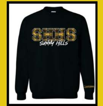
Stop by our pop up store at Lancer Days or shop online @ Sunnyhillsptsa.org and pick up at room 50 Fridays at Lunch