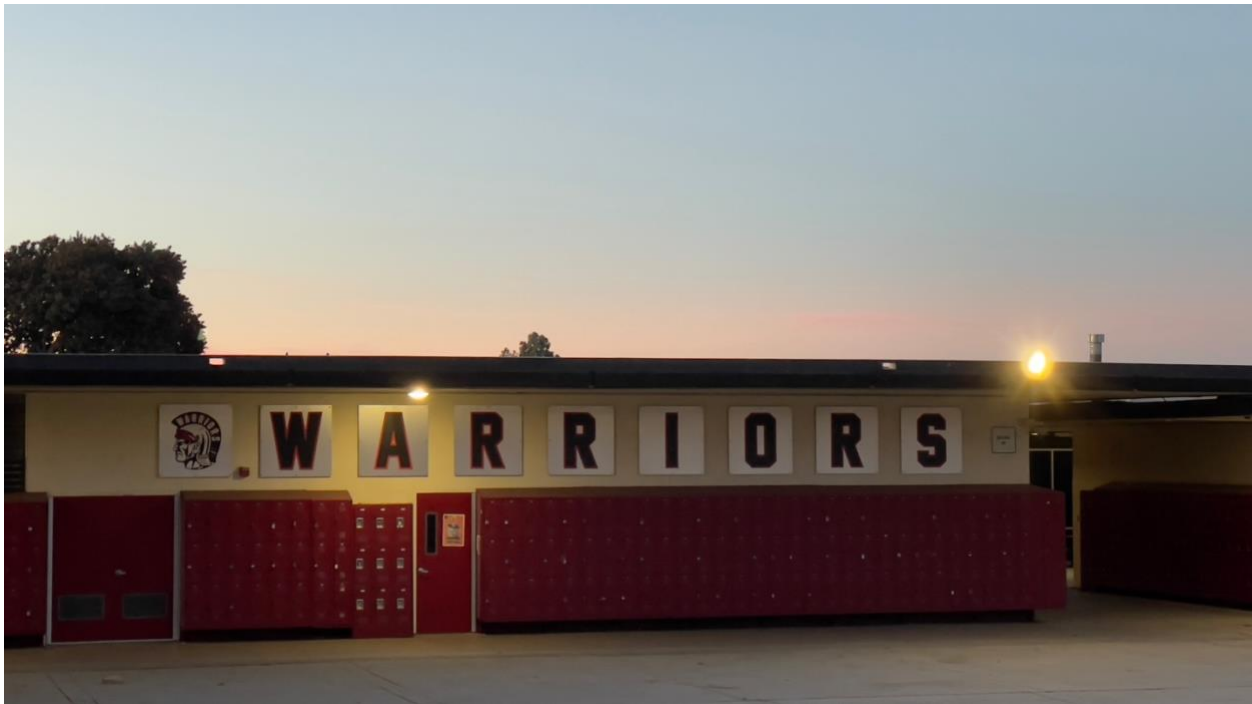
Sunrise at Troy High School, Winter 2025.

Please feel free to contact any Troy administrator should you have any questions.