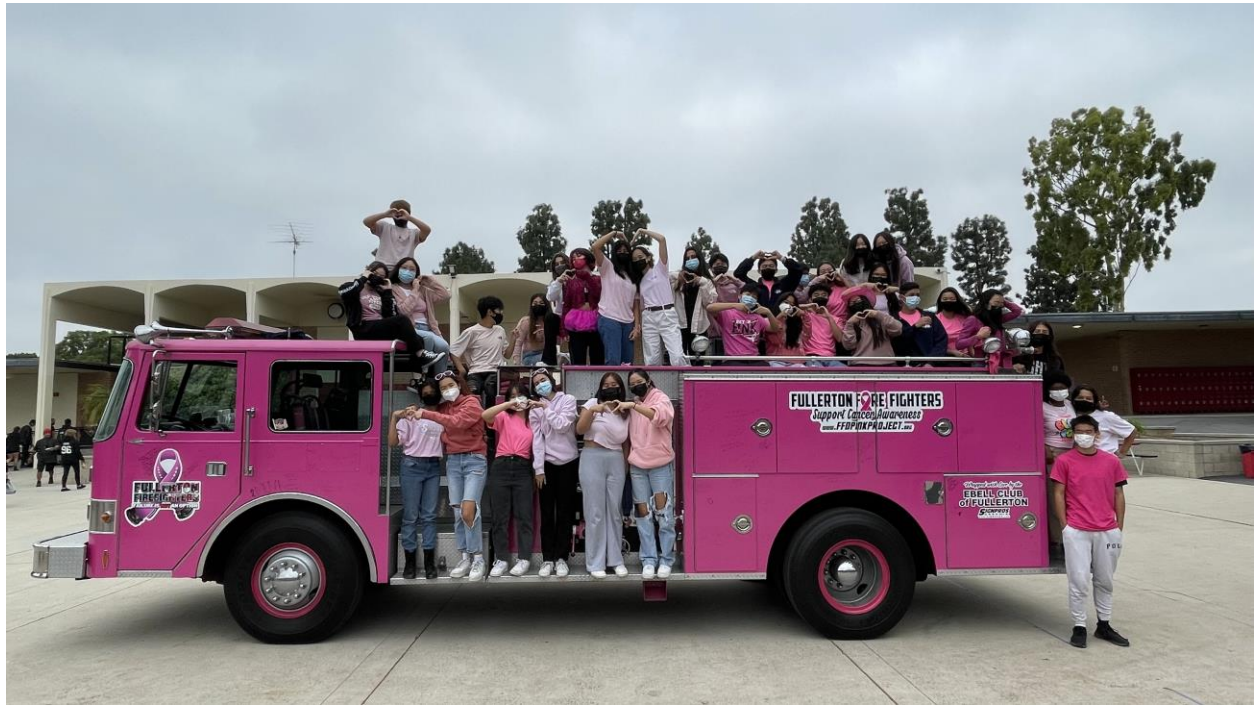
The Fullerton Fire Department's Pink 1989 Firetruck and Troy's ASB!

opportunity arises to see them perform or view their work, it is always a memorable and enjoyable experience! On that note, we have a theatre production coming to a nearby Troy High School stage early next month!