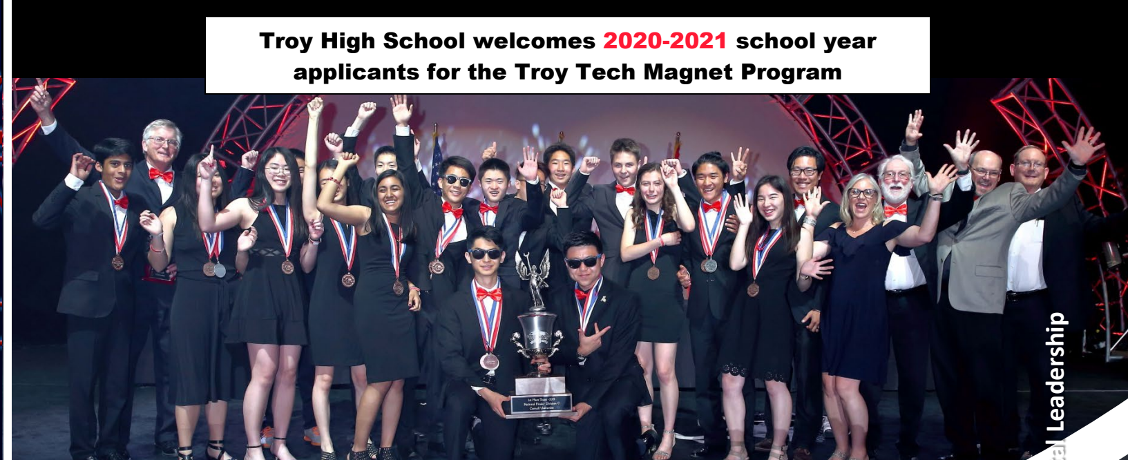
Three consecutive Science Olympiad National Championships 2017, 2018, & 2019

63% of Troy's athletes participate in Troy Tech