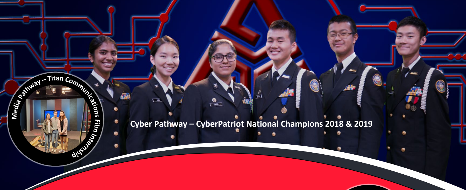
Cyber Pathway – CyberPatriot National Champions 2018 & 2019