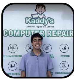
Kaddy's Computer Repair Intern