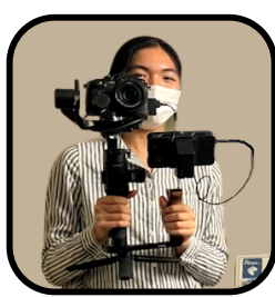
Promeli Videoworks Intern