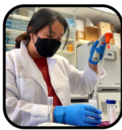
USC Keck School of Medicine Intern

#37 Best College Prep Public High School in the Nation 2023, Niche