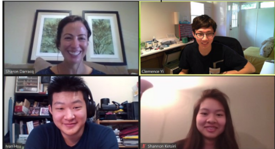
PTSA Student Leadership Thankful Video