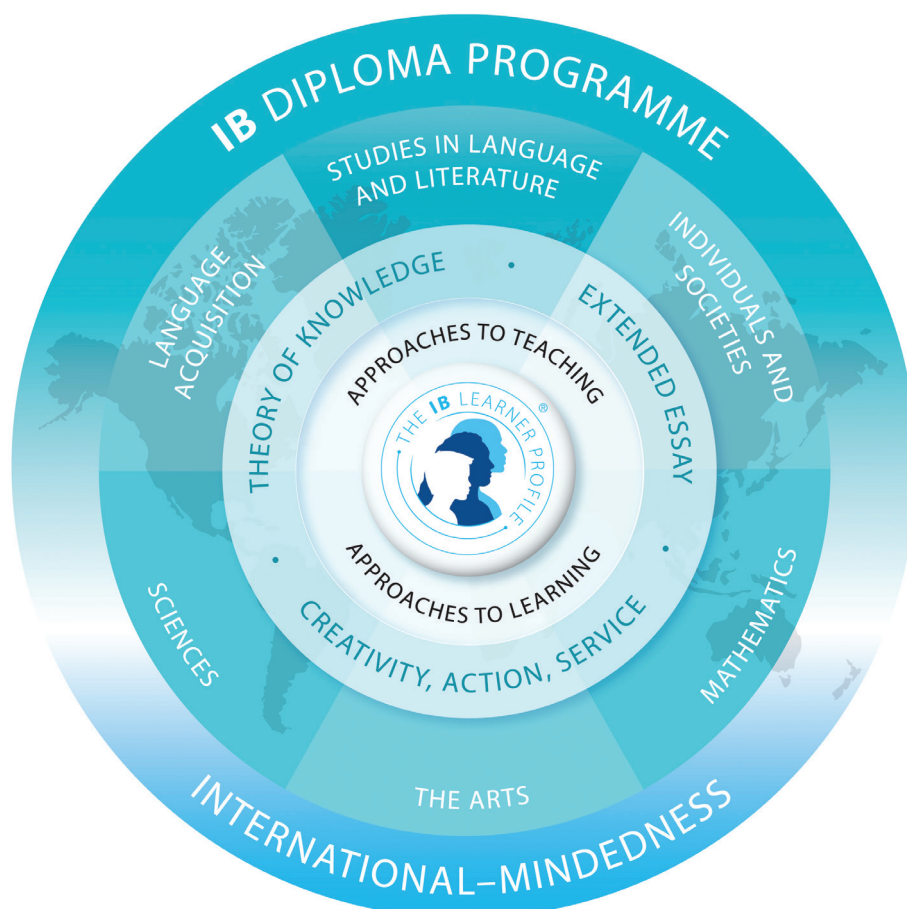
Figure 1 Diploma Programme model

The course is presented as six academic areas enclosing a central core (see figure 1). It encourages the concurrent study of a broad range of academic areas. Students study: two modern languages (or a modern language and a classical language); a humanities or social science subject; an experimental science; mathematics; one of the creative arts. It is this comprehensive range of subjects that makes the Diploma Programme a demanding course of study designed to prepare students effectively for university entrance. In each of the academic areas students have flexibility in making their choices, which means they can choose subjects that particularly interest them and that they may wish to study further at university.